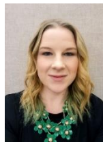
Sonja Schoenecker Central Administration Building - Finance WEA RA 2019 - Spokane, WA

I want to work for expanding and representing PT employees across the state as well as connecting with locals across the country successfully. I believe that in order to build a strong and more inclusive union, It's important to learn as much as you can as a representative. It would be an honor to be considered.